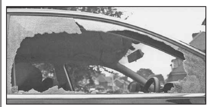
Bev Brown: Neighbors, protecting your valuables is always important — especially around the holidays. Better safe than sorry!

Report suspicious activity, 303-627-3100.