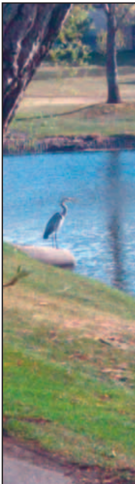
A pond on the golf course. Below: Two mallard ducks thought a swimming pool was just the right place!