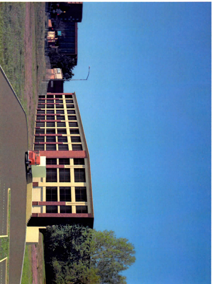
VIEW FROM NORTHEAST - AFTER