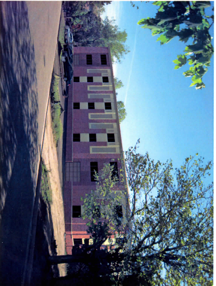
VIEW FROM SOUTHWEST - AFTER