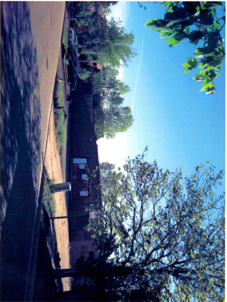
VIEW FROM SOUTHWEST - BEFORE