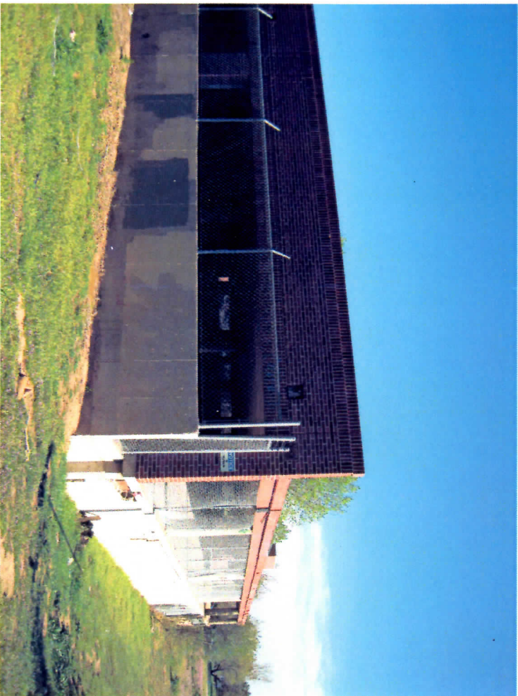
VIEW FROM SOUTHEAST - BEFORE