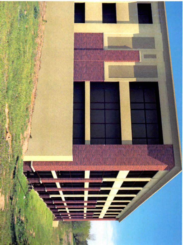
VIEW FROM SOUTHEAST - AFTER