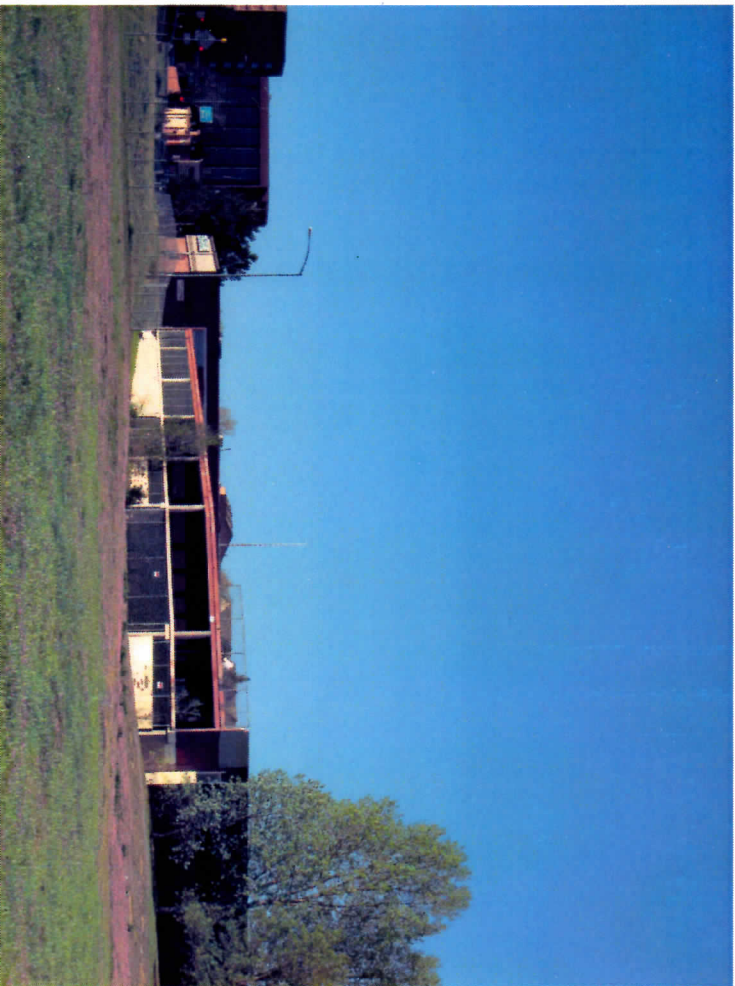
VIEW FROM NORTHEAST - BEFORE